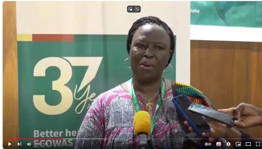
Regional Consensus Workshop on the Regional Strategy for Community health.